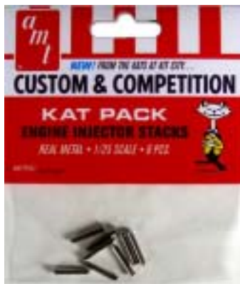
Metal Injector Stacks from AMT!