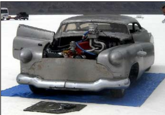
Buick Straight-8 powered Bonneville Merc!

Here's more "Food for Thought" in case anyone has been searching for a subject to model. PLEASE do not forward these pictures to ANYONE or post them on ANY site! Thanks!