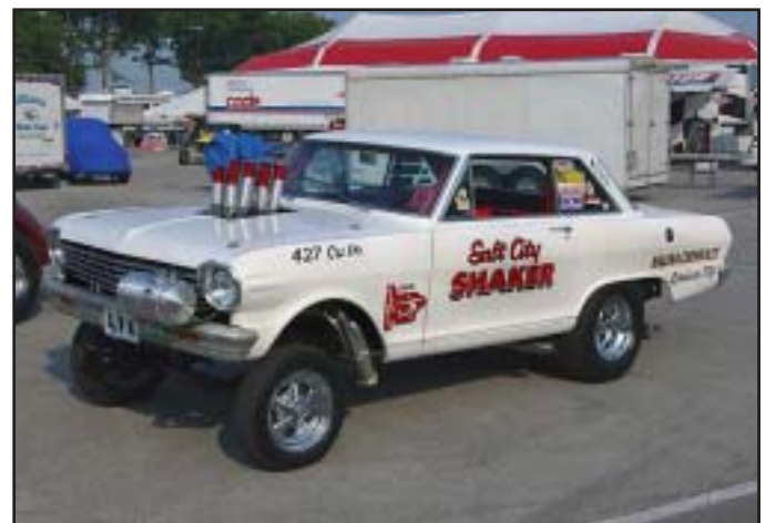
Very neat injected BBC A/FX!