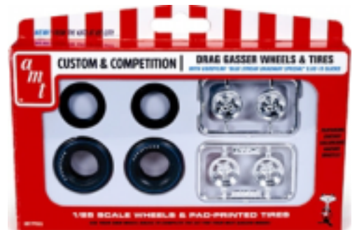
Drag Gasser Wheels & Tires!