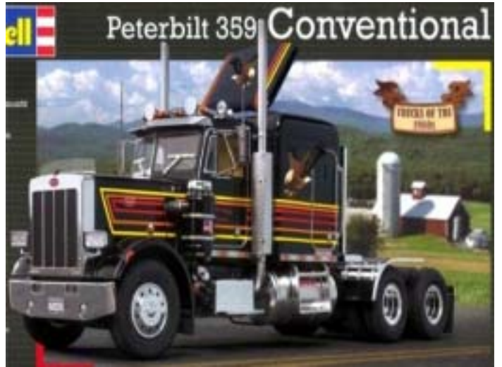
Ramp Truck Car Hauler and Peterbilt 359 - Two of the most sought after models in a long time!