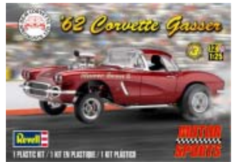
Goodyear Polyglas GT's!